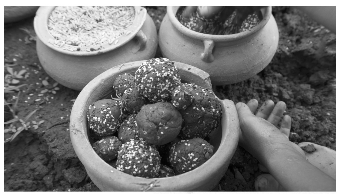
MAKE A SEED BALL