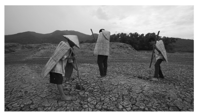
DIG A HOLE , PLANT A SEED