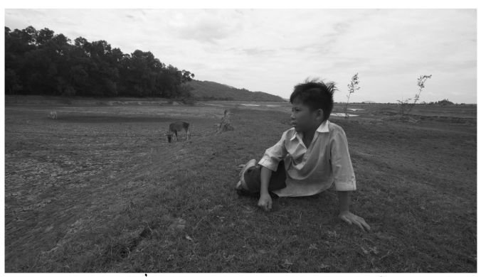
WAITING FOR WHAT HAPPENS